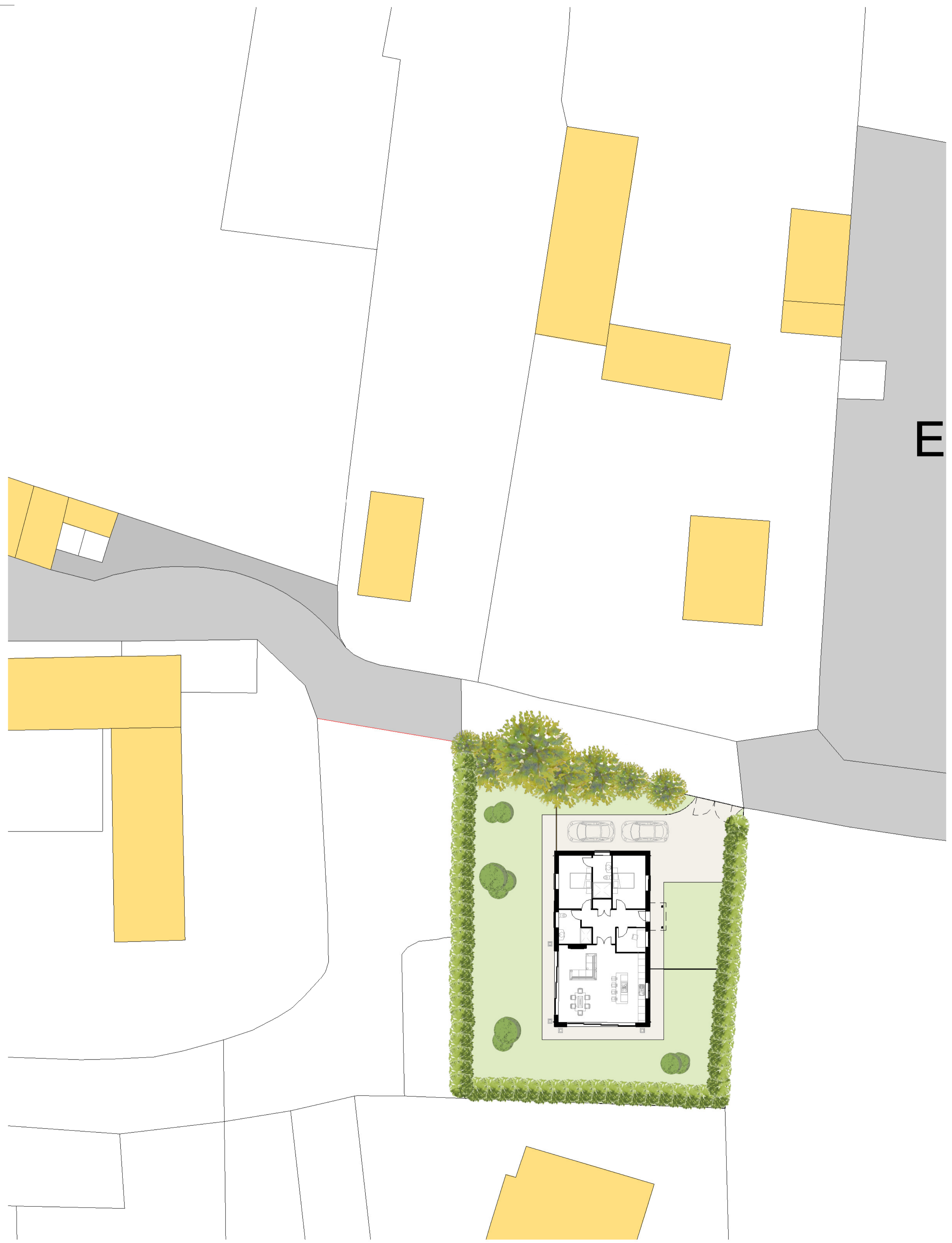
Proposed Site Plan 1 : 200

Do not scale from this drawing for construction or acquisition purposes. Responsibility is not accepted for errors made by others in scaling from this drawing. All construction information must be taken from figured dimensions only. All dimensions and levels must be checked on site and discrepancies between drawings and specification must be reported to HG2 Architects Ltd. © Copyright HG2 Architects Ltd.