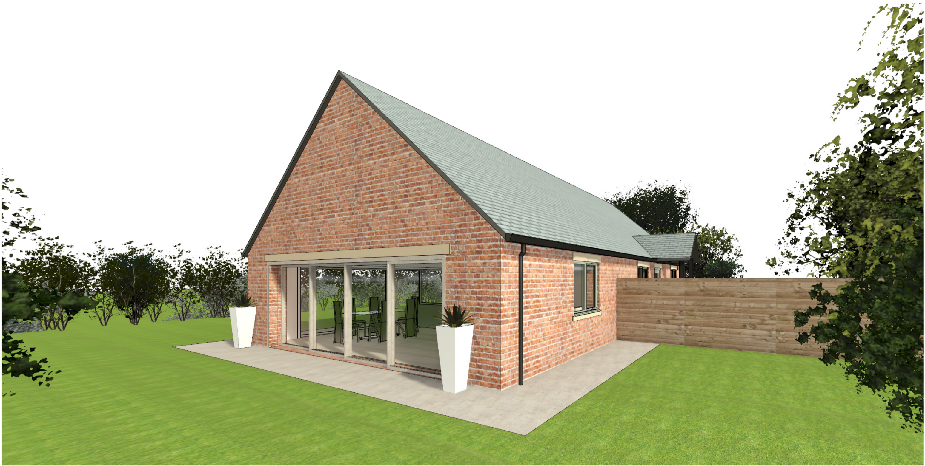
2 3D View 1