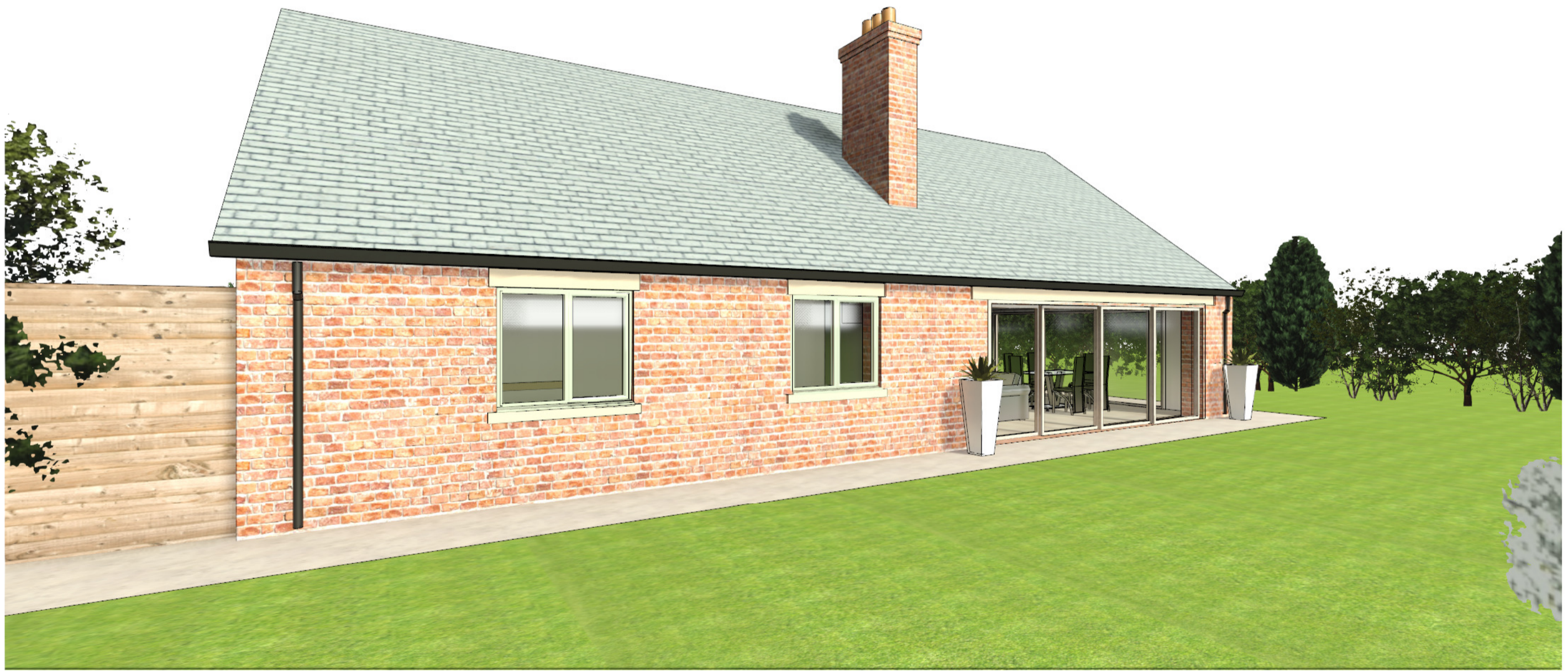
3 3D View 2

A 30.03.23 JCE JCE Revised in line with client comments